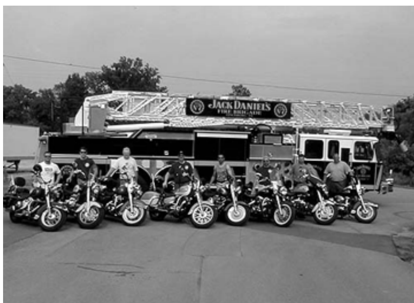
Members of Illinois-3 with the Lynchburg Ladder Truck During a ten day 2,700 mile road trip earlier this year, members of Red Knights Illinois-3 took a break in Lynchburg, Tennessee with the Jack Daniels Fire Brigade aerial