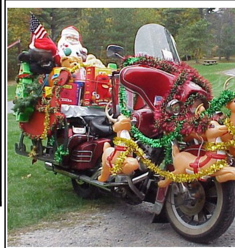
Santa's bike at the 2001 Red Knight (NY 12) Toy Run.

I G Q \ < 04 4 03 4 We shall never forget