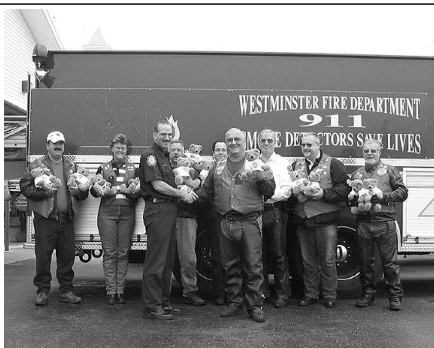
Members of Mass-2 delivering "Little Heroes" Teddy Bears to the Westminster Fire Department. Westminster was one of twelve departments within their membership area that Mass-2 visited.