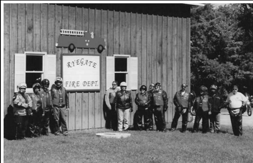
Red Knights – Vermont-Chapter-2 on one of their Grand Tour stops in Ryegate, VT this summer. Have you earned your Grand Tour Pin?

When you have completed your visits simply fill out the application form and return it with your pictures to the GT chairperson and he/she will send you your certificate and