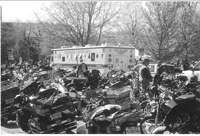
Some of the rides participating in the 2003 Maryland Firefighters' Memorial Ride