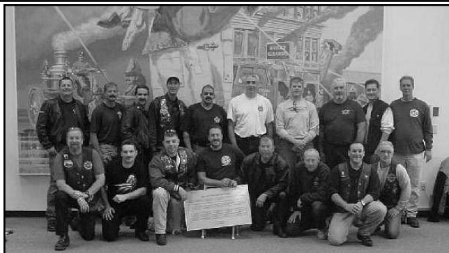
Members of Ohio-5 were hosts last fall to brothers from the New York City Fire Riders as they passed through Ohio on their way to

The issues discussed in these meetings are important to the club and every member has a right to participate in the discussions involving RKMC policy. The General Membership Meeting will be held on Saturday morning.