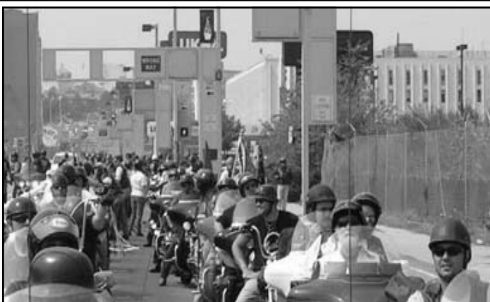
Members of NJ-14 at the 5th annual 9-11 Memorial Ride