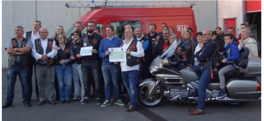
Members of Belgium 2 handing over the check for 1,250 euros.

On Saturday, September 26, a barbeque was given to thank the people who helped at the ride. We gave a check for 1,250 euro to the "Foundation Alexine Clarysse".