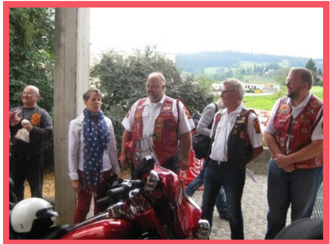
Ambassador Suzi LeVine arrives in style