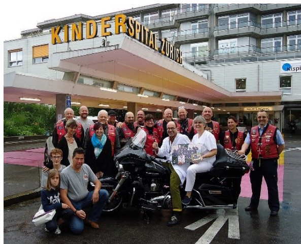
Members of Switzerland 1 handing over the check and with hospital staff