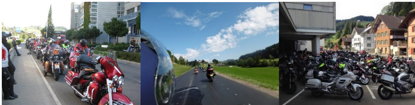
Red Knights MC, European Association Meeting 2015