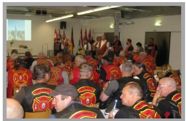
European Red Knights pay their respects to their fallen Brothers and Sisters