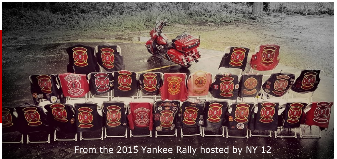
From the 2015 Yankee Rally hosted by NY 12

Thank you NY12 for taking on the huge task of hosting the 1st ever Yankee Rally! Great Job and so much FUN!