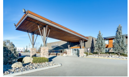
Heritage Inn High River

We have secured the Heritage Inn & Conference Centre in High River Alberta. The Heritage hotel is complete with a restaurant, bar, indoor swimming pool, including an exercise room. Rooms include breakfast for 2 at $130 CND per night. Code Red Knights. We have reserved 50 rooms. The overflow Canalta Hotel is across the street but at a higher cost.