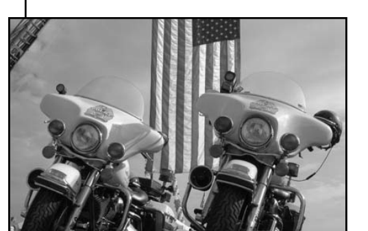
Now that's a Ladder Truck!

You can read more about the ride under the National Fallen Firefighters Foundation Web Page at: www.firehero.org