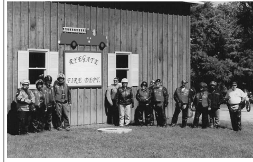
Red Knights – Vermont-Chapter-2 on one of their Grand Tour stops in Ryegate, VT this summer. Have you earned your Grand Tour Pin?

When you have completed your visits simply fill out the application form and return it with your pictures to the GT chairperson and he/she will send you your certificate and