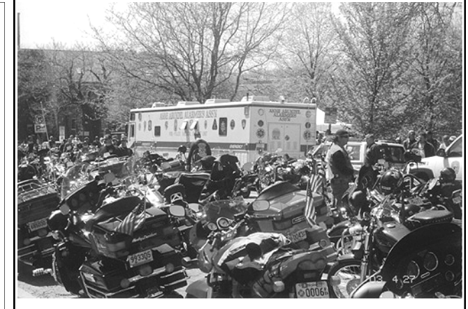
Some of the rides participating in the 2003 Maryland Firefighters' Memorial Ride

U.S. and Canada. Red Knight members are responsible for bringing in thousands of dollars to this