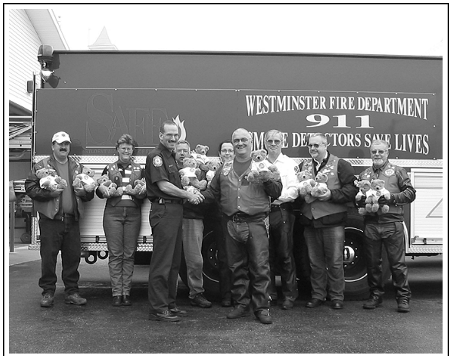
Members of Mass-2 delivering "Little Heroes" Teddy Bears to the Westminster Fire Department. Westminster was one of twelve departments within their membership area that Mass-2 visited.

The program initiated by the Vermont Teddy Bear Company (www.vtbear.com) is two fold. First, if you are an emergency services provider or a non-profit entity "Little Hero" bears are available to be purchased at a reduced rate. A non-profit group, like our local chapters, could