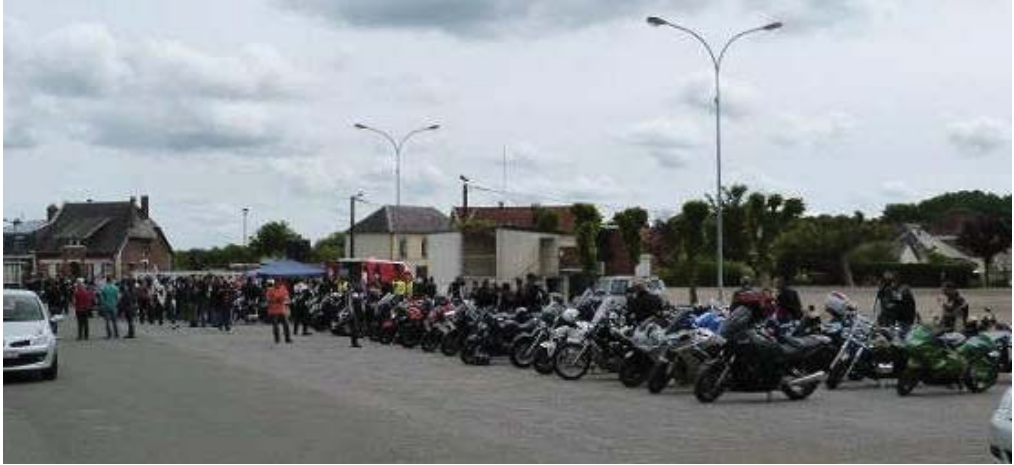
Some of the motorcycles attending the Charity Ride

One of the highlights of the year was the 90km charity ride for Jeremy, a young boy with cerebral palsy where 130 motorcycles took part plus members from RKMC France 3, Belgium 1 and 5. 700 euros was raised for him.