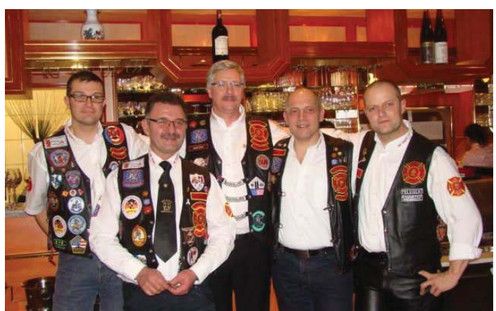
Members from Belgium 1, 2 & 4 and France 1 at the 1<sup>st</sup> Anniversary party