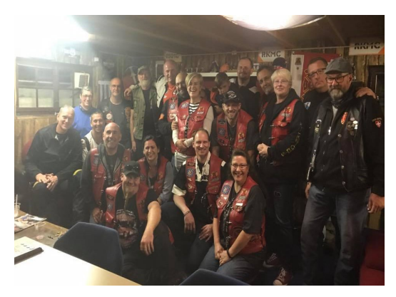
Switzerland 1 and Despatch Riders

The tour took place June 25<sup>th</sup> through 30<sup>th</sup>, crossing Belgium, France, Italy, Switzerland, Austria and Germany, the riders arrived in Lucerne on the 26<sup>th</sup> where we met for a coffee and some small talk before they continued their ride to Italy. Colonel from Switzerland 2 accompanied them to the Grimsel Pass.