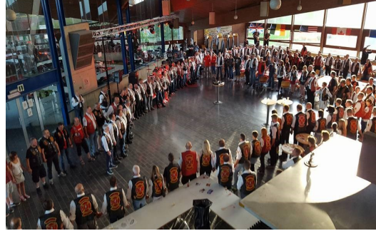
European Knights at the 2016 European Convention

At the end of May 2017, we have eight hundred and sixty five (865) Members in Europe. Ninety six (96) of them are MALs and live in sixteen (16) Countries. In thirteen (13) Countries we will find forty four (44) Chapters and I know that the forty fifth will be chartered in the next few months.