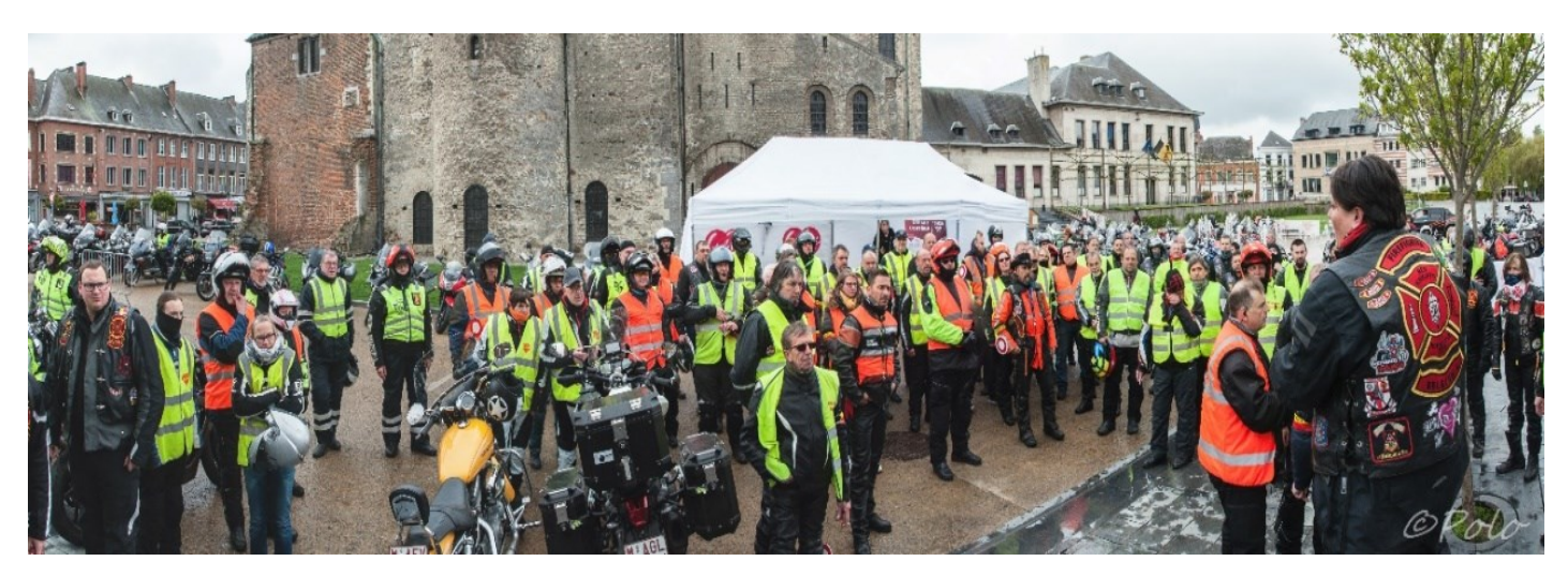
Belgium 4's President addresses the gathering

Since 2012, the Red Knights have assisted with the organising and marshalling of the Télévie rally in Belgium. Télévie was created on the initiative of private television station RTL TVI, which aims to raise funds to advance leukaemia and cancer treatment in both children and adults.