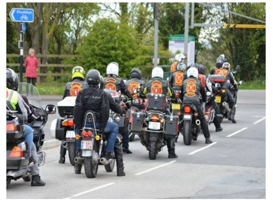
Setting off for the ride to Llandudno

Wales I at Rhuddlan, North Wales and as well as members from the UK and Ireland. It was a pleasure to welcome members from Belgium, Switzerland and Luxemburg and we thank them for making the effort to