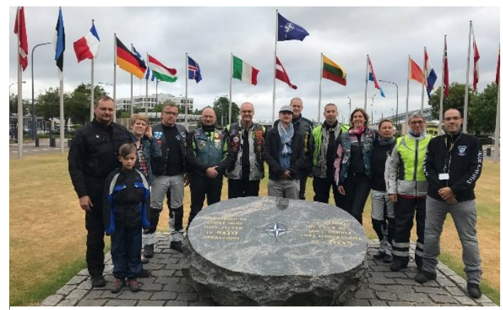
Red, Blue and Green Knights together with the Despatch Riders