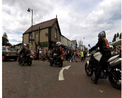
Wales 1 spread the word about the Red Knights at the Prestatyn Carnival