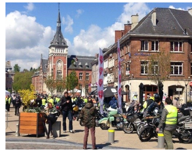
Participants prepare to ride off