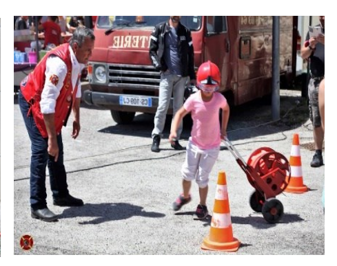
Children trying their hand at some firefighting drills

For the older ones, there was the animation bull "Rodéo", creation of stainless steel objects, leather craftsmen, vinyl musical supports and many other exhibitors!