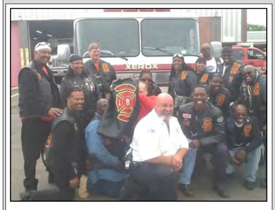
Members of RK Mass-15 during their Grand Tour "Alphabet Tour" at the Xerox FD.

You must have a picture of you and your motorcycle taken at each station, with the name sign visible.