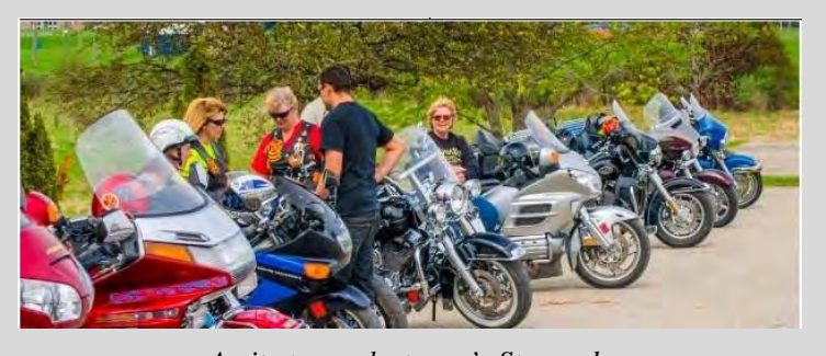
A pit-stop on last year's Stampede

Vermont Chapter 4 is proud to lead the motorcycle ride for the 3 Day Stampede for Cure for Cystic Fibrosis.