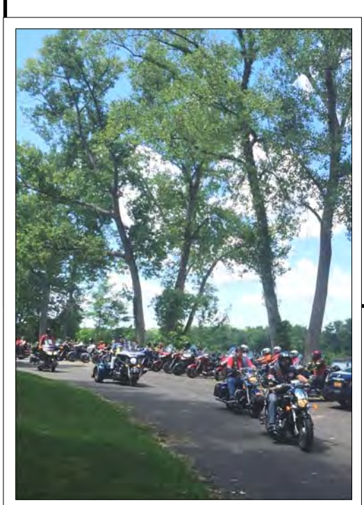
Red Knights Connecticut State Picnic

The Nominee must complete the Nomination Profile prior to close of nominations and provide a photo.