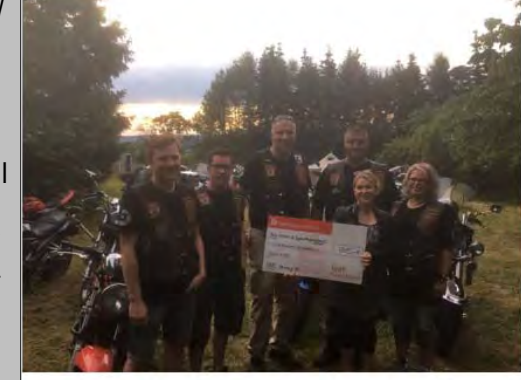
Members from Germany 3 hand over their cheque

Check out our website for more info about us. www.red-knights-germany3.de