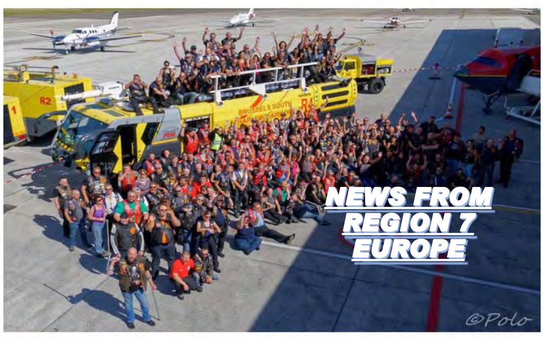
Group photograph from the 2016 European Convention's visit to Charleroi Airport

The day began with a presentation of the organization and Red Knights France 1, with a word from the Vice-President, in welcoming participants over a coffee. After the distribution of