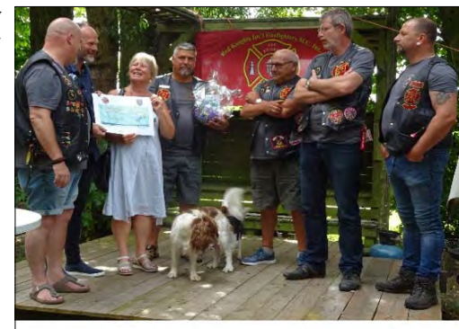
Belgium 2 members present their cheque