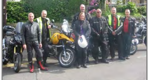
England 2 Members at the Charity's Offices