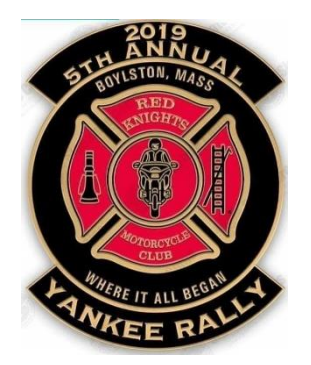
2019 Yankee Rally Challenge Coin

Special presentations, consisting of numbered challenge coins in custom display cases, were bestowed upon the Founding Fathers and the family members of the Heaven One Founding Fathers. The challenge coins, numbered 1-11, represented the original 11 men who started the Red Knights International Firefighters Motorcycle Club back in 1982.