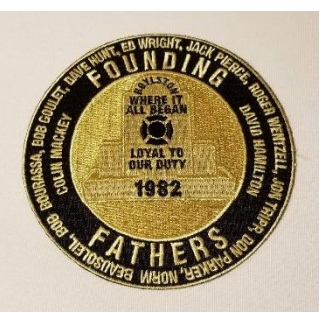
Founding Fathers' Patch