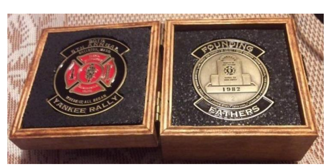
Presentation Box for Founding Fathers Open